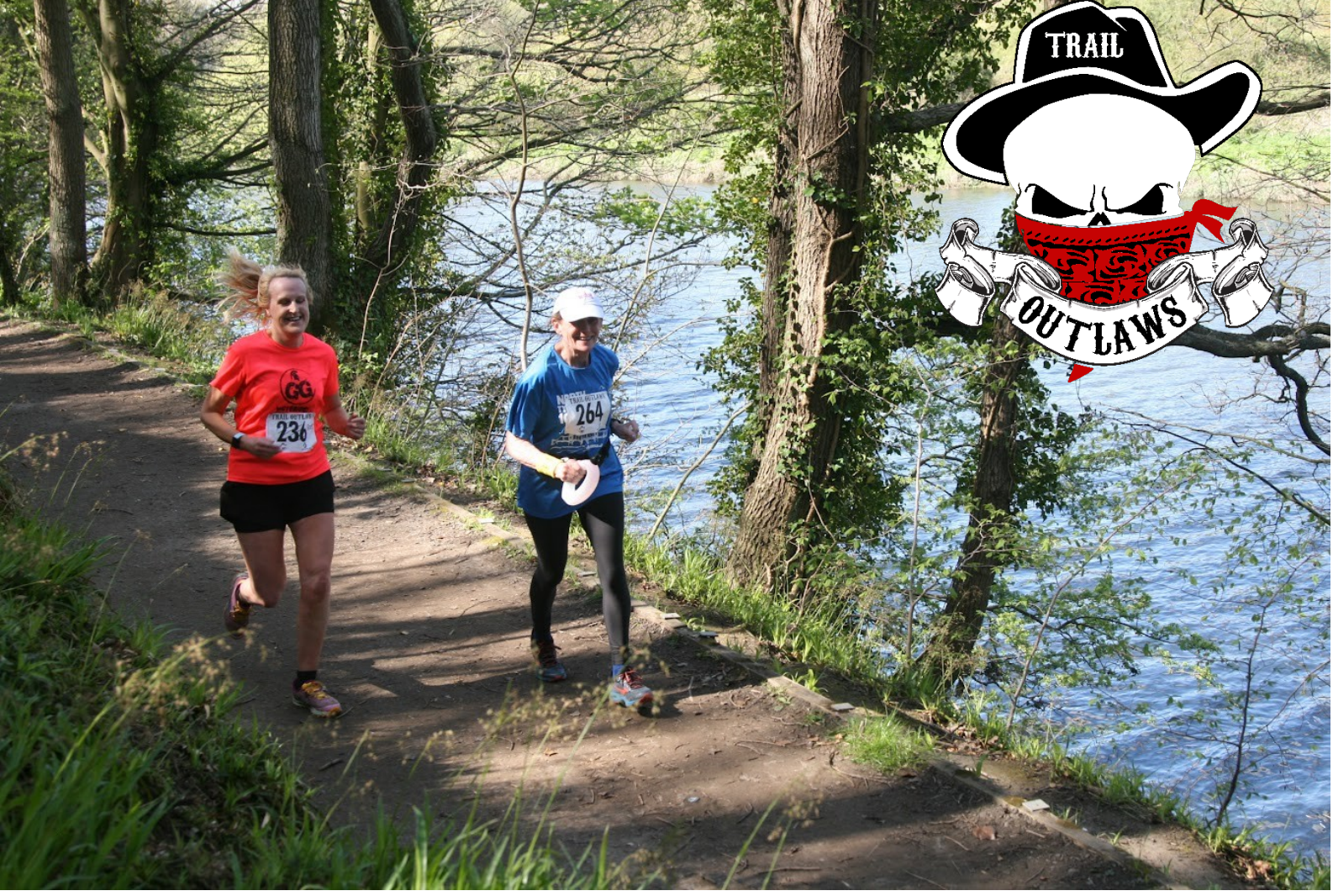
Thank you for entering the:-